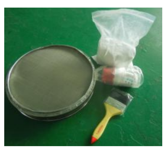
Mesh and parts for filtering test dust