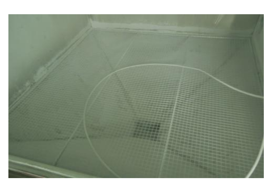
Internal chamber with sample tray & Hopper for dust collection

Haida International Equipment Caibai No.1 Industrial Zone Daojiao Town, Dongguan City Guangdong Province China Phone 86 796 89201068