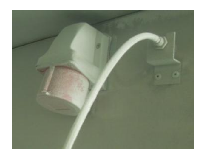
Anti-dust socket for sample connect to power source